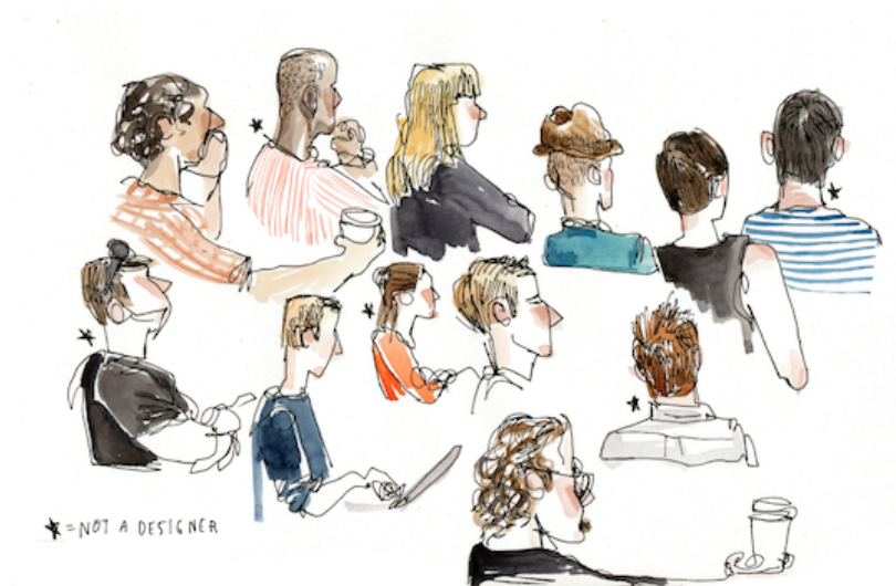
Figure 2: *Not A Designer: Illustration of a LEAP Group