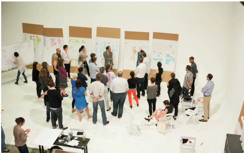
Figure 3: LEAP Symposium Participants Engage in a Working Session on Day 2

Structurally, the LEAP symposium’s driving characteristic resided in the participant-led nature of the conversation, which was envisioned as a true exchange of ideas and reframing of collective insights. In practical terms, this aspiration translated in a programmatic format and flow for the symposium that clustered participants in small-group working sessions that evolved in focus and makeup over the three days of the conference. (Figure 3).