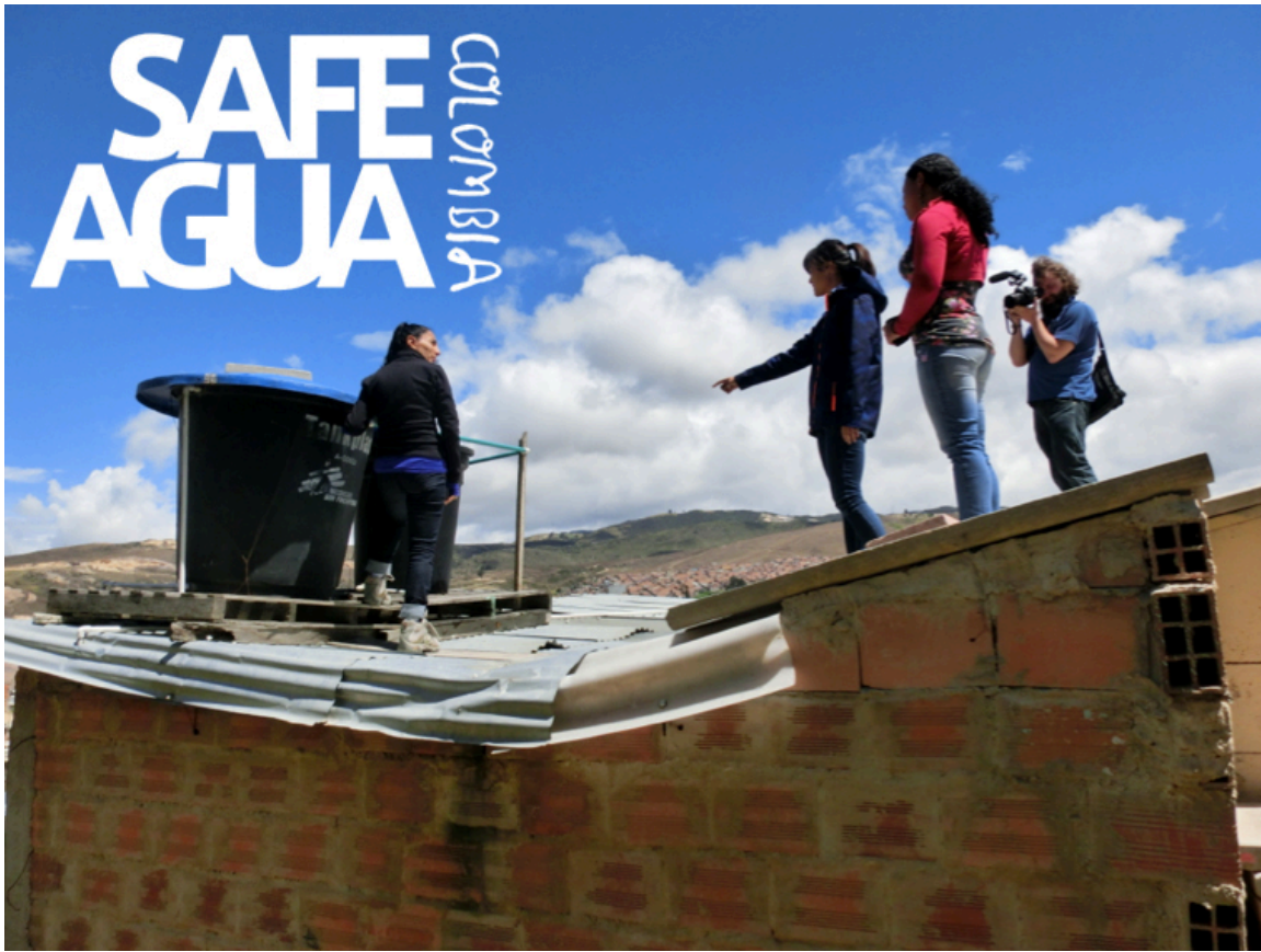
Figure.1 Field research in Safe Agua Colombia.

Safe Agua integrates social entrepreneurship teaching instruction through a partnership with the University of Southern California's Marshall School of Business Brittingham Social Enterprise Lab, where the director of the program and graduate students collaborate with the lead design faculty on key modules and various stages of project incubation that emphasize business and entrepreneurship skills and methods within the social mission framework of the initiative. 4