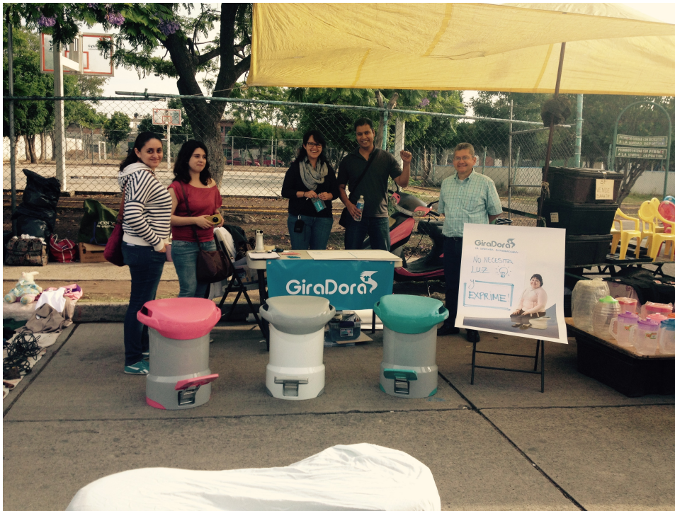
Figure.5 GiraDora market stand: Testing GiraDora 's response at a Sunday market and engaging with potential users.