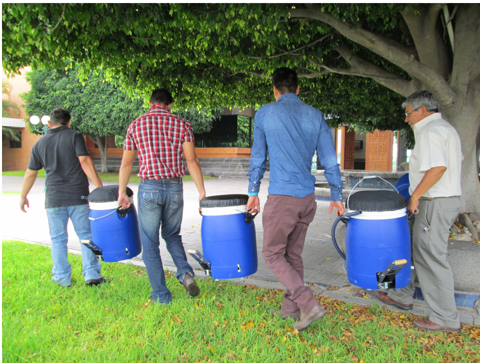
Figure.4 Engineers carrying GiraDora prototypes.

Before being at the helm of the current product's market testing with the manufacturer in Mexico, Prieto field tested the initial GiraDora prototype in Cerro Verde during the 2011 Safe Agua Peru course to help assess the viability of the product with base-of-the pyramid consumers. The pull-out section below offers her firsthand perspective during the Cerro Verde field testing—a critical stage of co-creation that resulted in perhaps the product's key breakthrough innovation: its combined washer-and-drier feature.