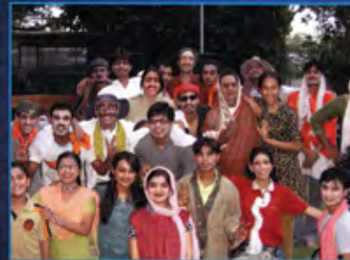
Monsoon season in Delhi with Street Theater actors