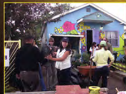
The Watts House Project, an artist driven neighborhood redevelopment project centered around the historic Watts Towers.