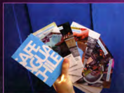
Research Methodology Cards created by Environmental and Product Design faculty for the Safe Agua Chile project