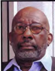
La Monte Westmoreland

La Monte Westmoreland has been an active presence in the Los Angeles art scene for the past thirty years. Since his inclusion in the 1972 exhibition, A Panorama of Black Artists at the Los Angeles County Museum of Art, he has been on the scene ever since, not only as an artist, but also as a respected teacher, curator and collector. Westmoreland works primarily in collage and assemblage and has produced several notable series: Watermelon Series, Shadow Series and Target Series. In the Watermelon Series, he cleverly incorporates watermelons into the hands of familiar iconic settings. In the Shadow Series, he incorporates images of well-known artists such as Jasper Johns and Robert Rauschenberg with those of lesser known African American artists such as Norman Lewis, Romare Bearden, Charles White, and Richard Wyatt.