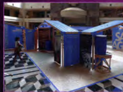
SAFE AGUA exhibit at the Inter-American Development Bank in Washington, DC, June 2011