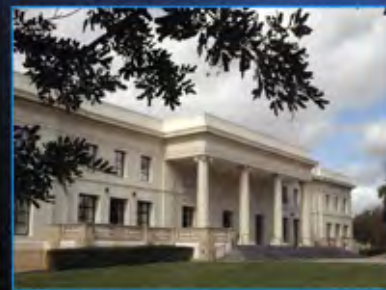
The Huntington Library's Munger Research Center.