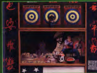
Close up of "Shadow Series" Jasper Johns with Jacob Lawrence. Media: Assemblage. Size: 30"x20"x5"