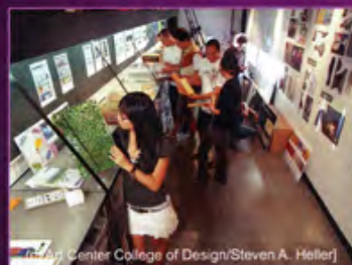
The materials library in Art Center's Color, Materials and Trends Exploration Laboratory provides students with the resources to become better problem solvers, innovators, storytellers and leaders.