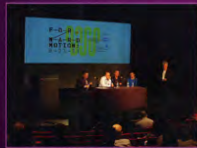
The "Forward Motion: Advancing Mobility in California & Québec" Convergence of Circumstances at Art Center College of Design.

E verywhere we look are objects that have been designed; your car, your champagne glass, and your clothes. College curriculums, business strategies and new technologies are also designed with something very specific in mind: functionality and your life. Designers must have an instinct for understanding human behaviors and habits, some of which transcend countries and cultures – others do not.