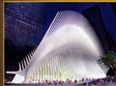
The World Trade Center Port Authority Trans-Hudson Transportation Hub was designed by world-famous and celebrated Spanish architect Santiago Calatrava.